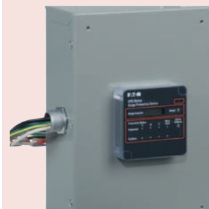
All SPD Series sidemount units come prewired and include a factory-installed conduit interface, making installation very easy.