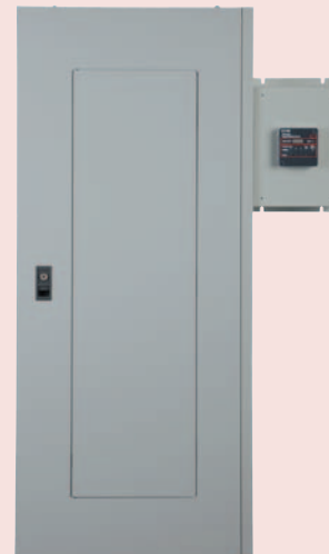
Eaton SPD Series sidemount unit mounted externally to an Eaton panelboard.